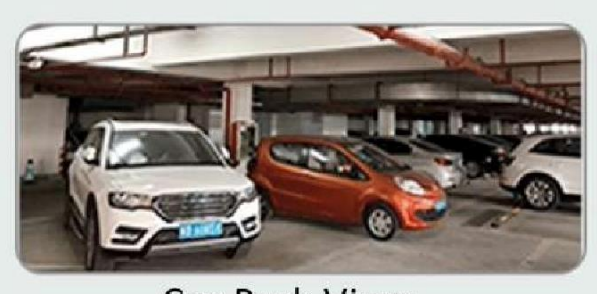
Car Park View